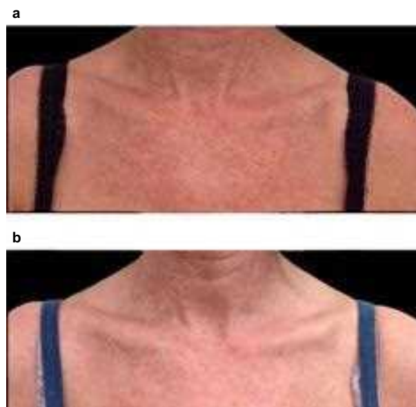
Figure 8 Décolletage: This 62-year-old female patient was treated with 1.5 mL of Radiesse ® + 9 mL of saline (final dilution, 1:6). Radiesse ® was delivered via 27 and 30 Gauge needle in a microbolus injection and a cannula with 50 mm-length and 25 Gauge-diameter (27 and 30 Gauge were both used for convenience and considering the body region). (a) At baseline, her décolletage skin thickness was very thin (grade 1) and the décolletage skin laxity and wrinkles were mild (grade 1 on the Merz scale). (b) The improvement reported at 3 months after 6 sessions of Radiesse ® injection was good (grade 3).

Patients reported feeling a clearer and more glowing skin. They also declared to perceive a greater skin firmness and to observe a progressive reduction in skin laxity as well as a more harmonious facial contour. They did not experience any perception of swelling and observed gradual results, which stabilized after just a few days.