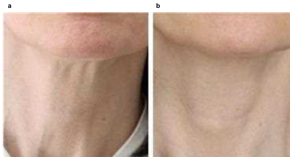
Figure 7 Neck: This 58-year-old female patient was treated with 1.5 mL of Radiesse ® + 6 mL of saline (final dilution, 1:4). Radiesse ® was injected with a 27 and 30 Gauge needle and a cannula with 50 mm-length and 25 Gauge-diameter (27 and 30 Gauge were both used for convenience and considering the body region). (a) At baseline, her neck skin thickness was thin (grade 2) and the facial skin laxity and wrinkles were moderate (grade 2 on the Merz scale). (b) The improvement reported at 6 months after 3 sessions of Radiesse ® injection was good (grade 3).

Neck, décolletage and hands were also targeted by using hyperdiluted Radiesse ® according to the different approaches reported below, where results for each body region in three different patients are also presented (Figures 7–9).